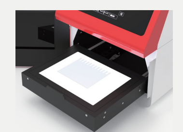
White light panel for protein gel