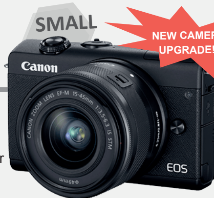
Canon EOS M200

Shutter Speed(s): 1/4000~30second Video Output: NTSC/PAL selectable (HDMI) Interface: USB(v.2.0),Wi-Fi Storage Media: SD,SDHCmemorycard Storage Format: JPEG(ExifVer2.3),RAW Dimensions(mm): 108* 66.6* 35