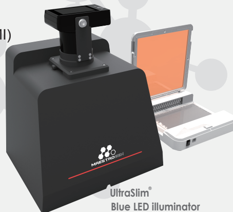
UltraSlim® Blue LED illuminator (SLB-01W)